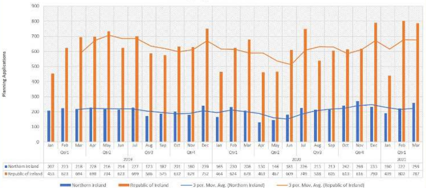
Planning Application Trends

[1] EXCLUDING SELF BUILD AND STUDENT ACCOMMODATION APPLICATIONS